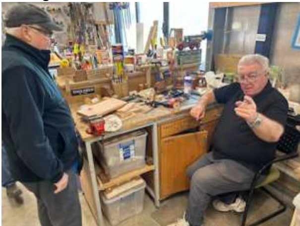
Don't point that sausage finger at me!