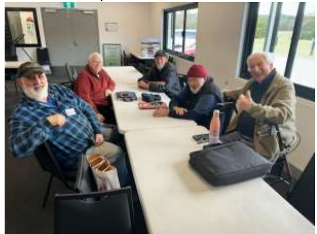
The Dodgy Brothers