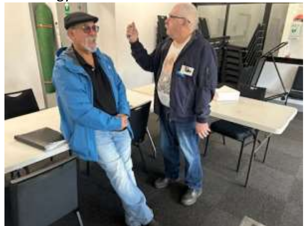
2 x Hard working buggers!