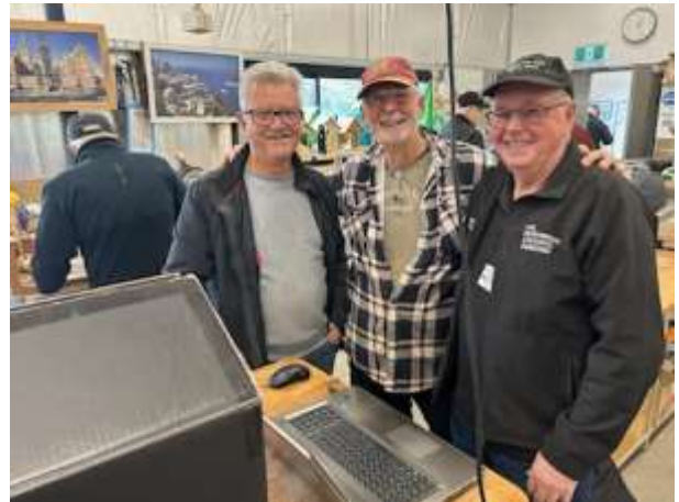
The “usual Suspects”