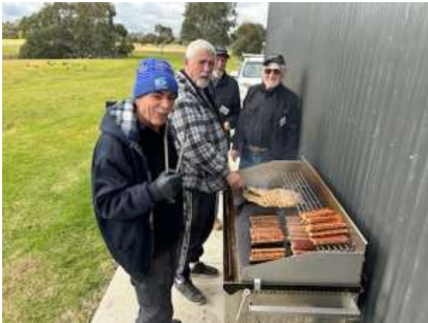
Waiting for the Pizza Oven?