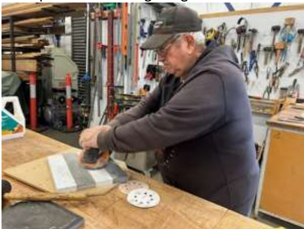
What will this become?