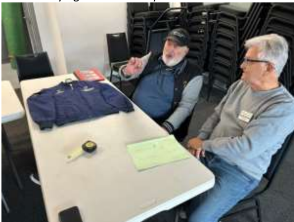
Who knows what's being plotted here ???