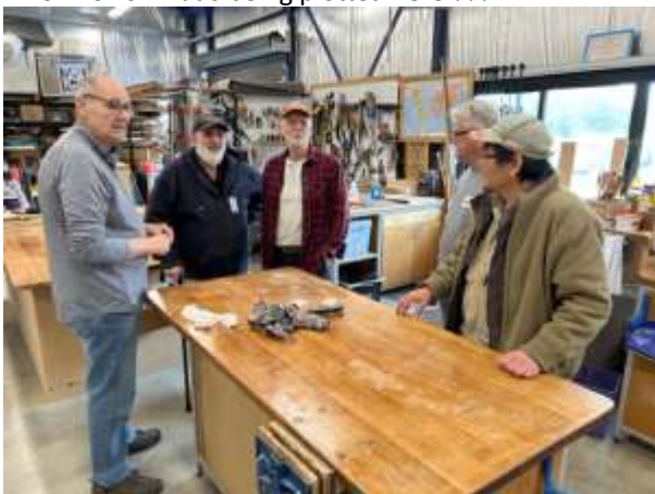
Treasurer hunting down (Dodgy) Fare Fee evaders

I don't know if Facebook has ever caused the lame to walk but it has sure caused the dumb to speak.