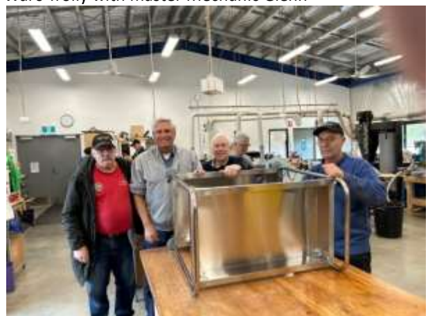
"The usual suspects"