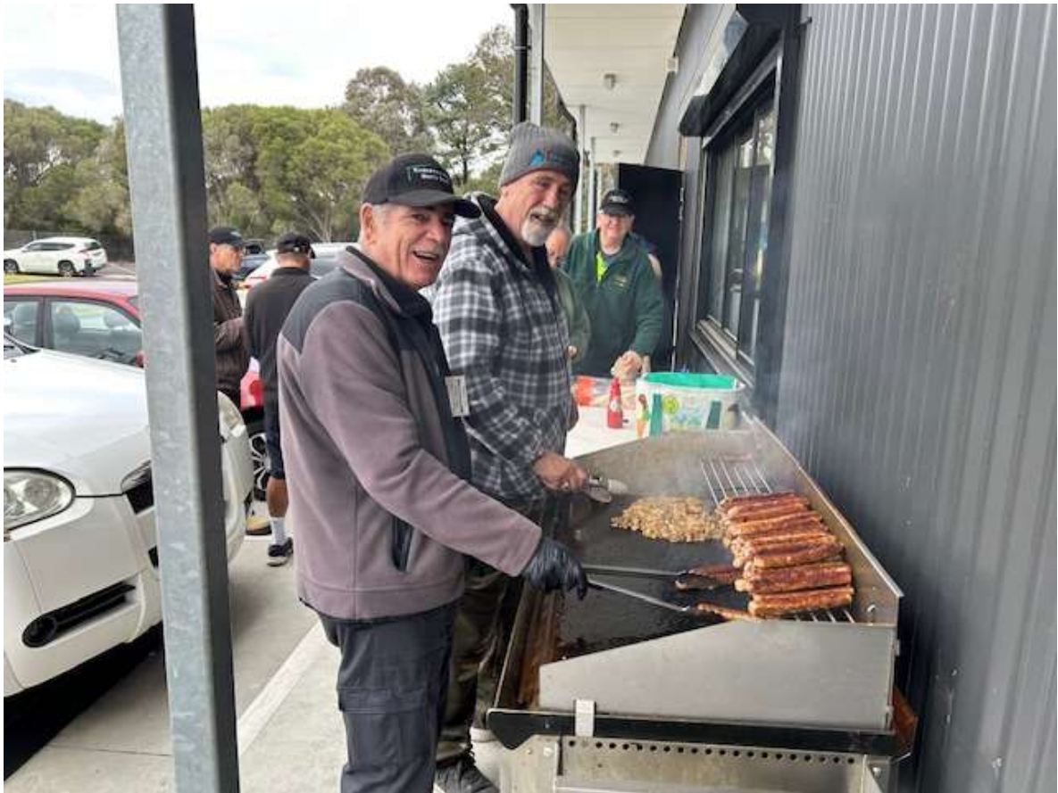
The Sausage Gaggle