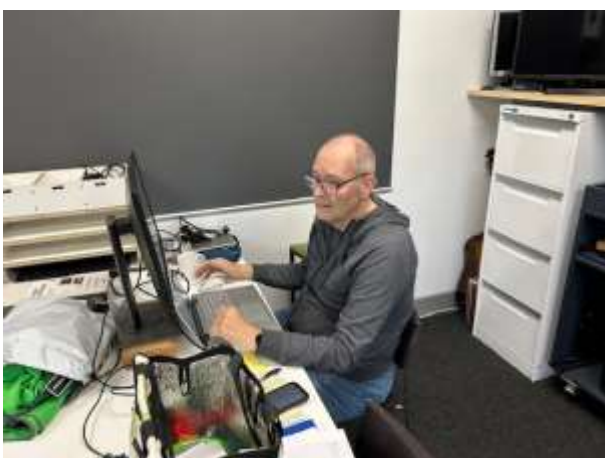
I hope our books are neater than this?