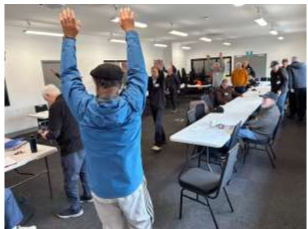
AJ et al, in Bank Robbery Position