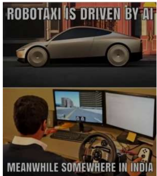
AI as it's meant to be used?