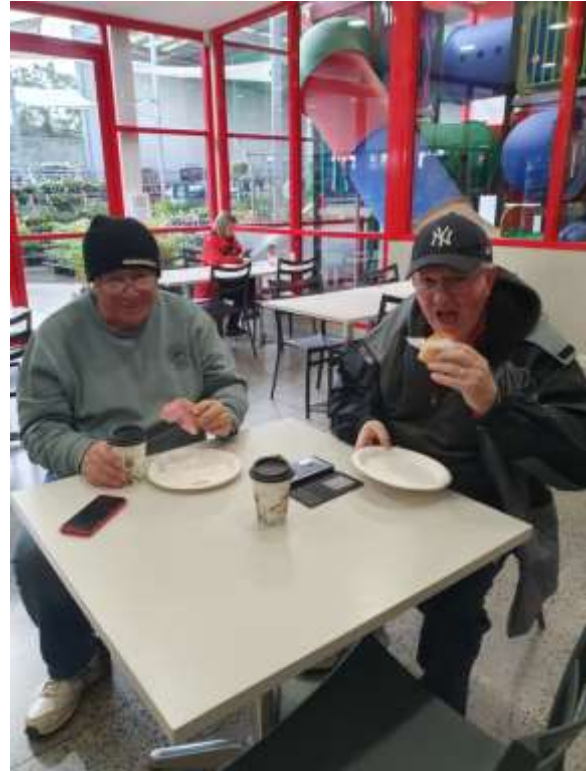
Two Little Piggies Sitting at a Trough