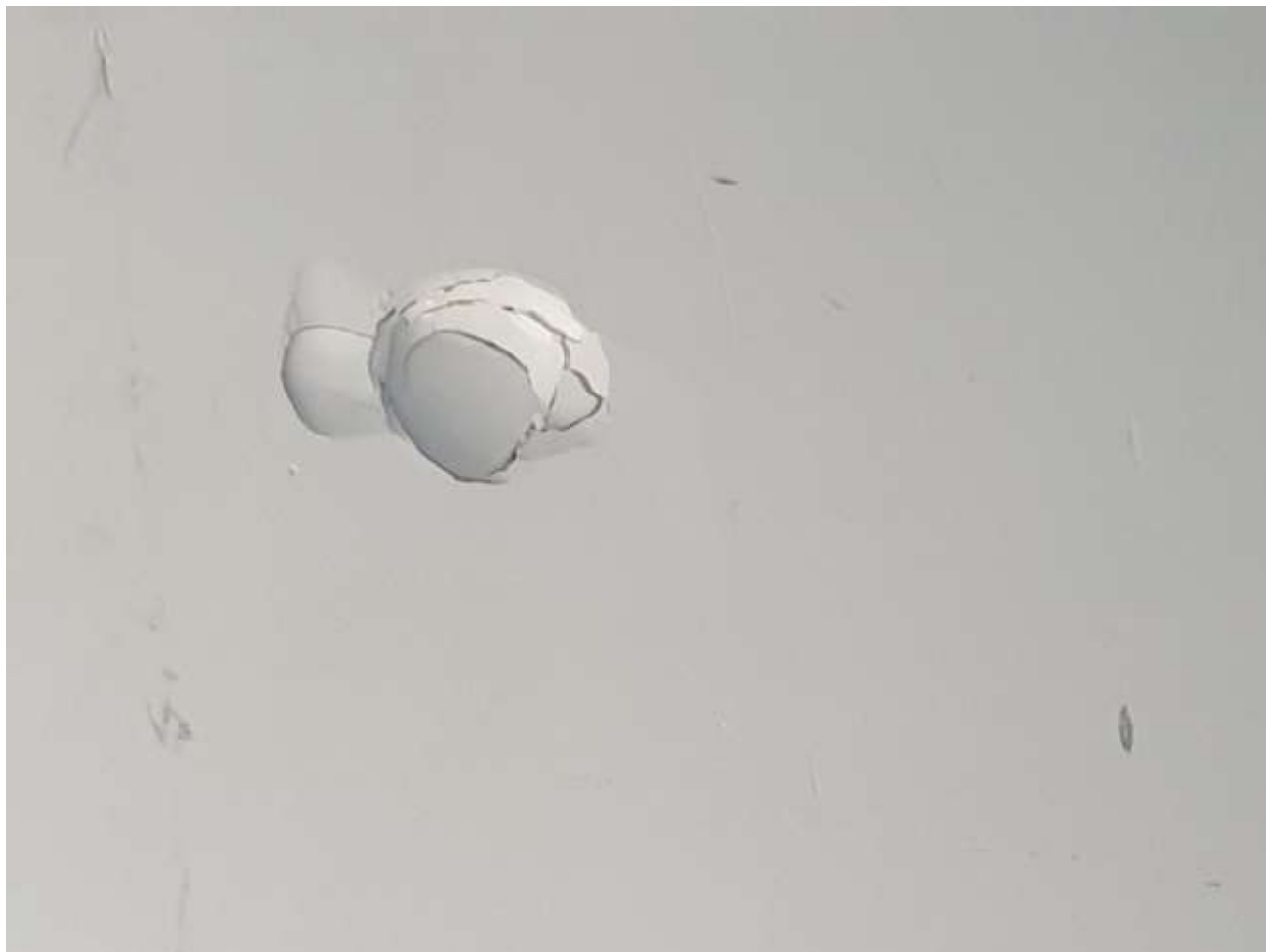
(What some people will do for attention!)