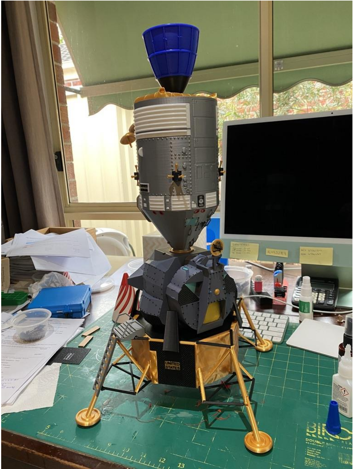
3Dprinting, filling in those lazy hours, when you don't have a wife or grandchildren to obey.