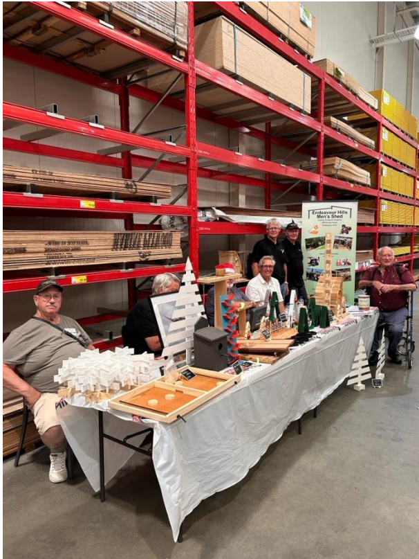
A Bunnings Christmas