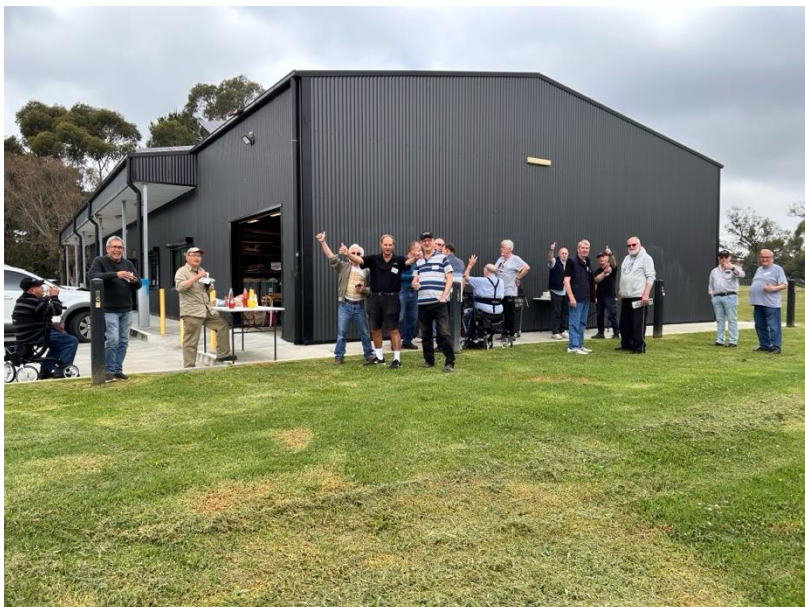
Some full bellies!