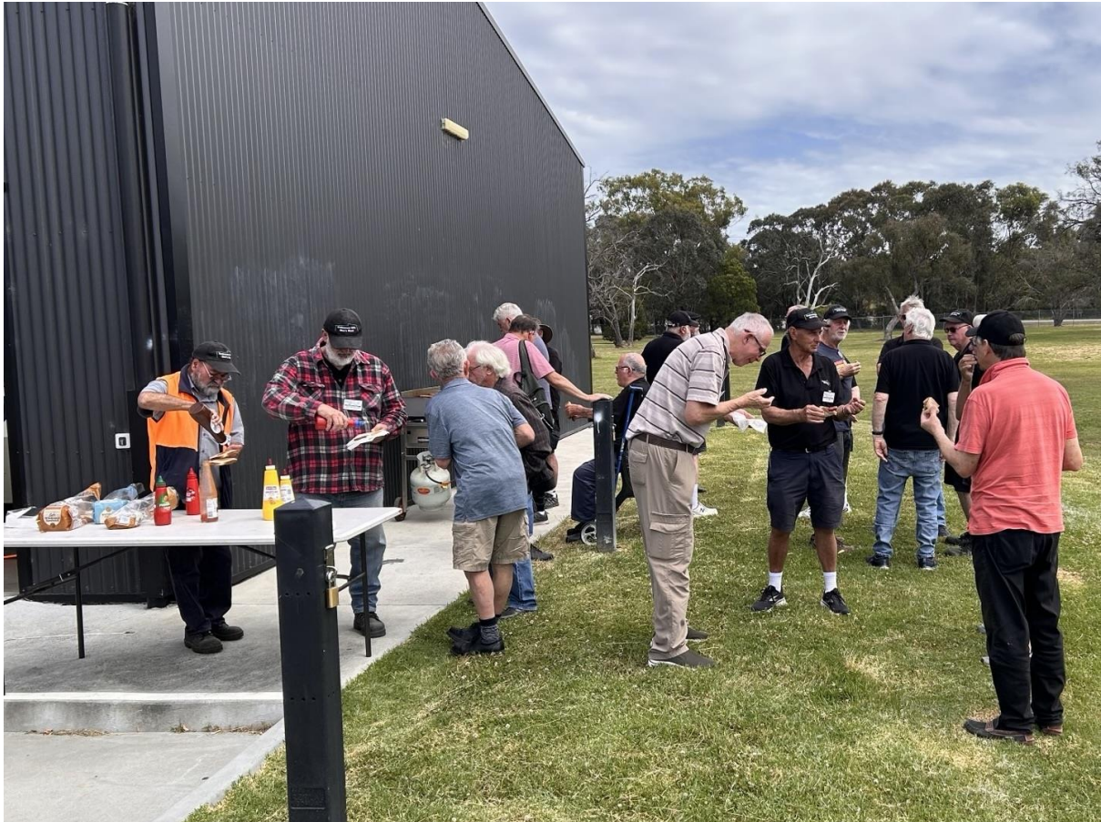
That orange shirt sure stands out!