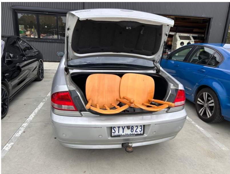
Coming into the Workshop!