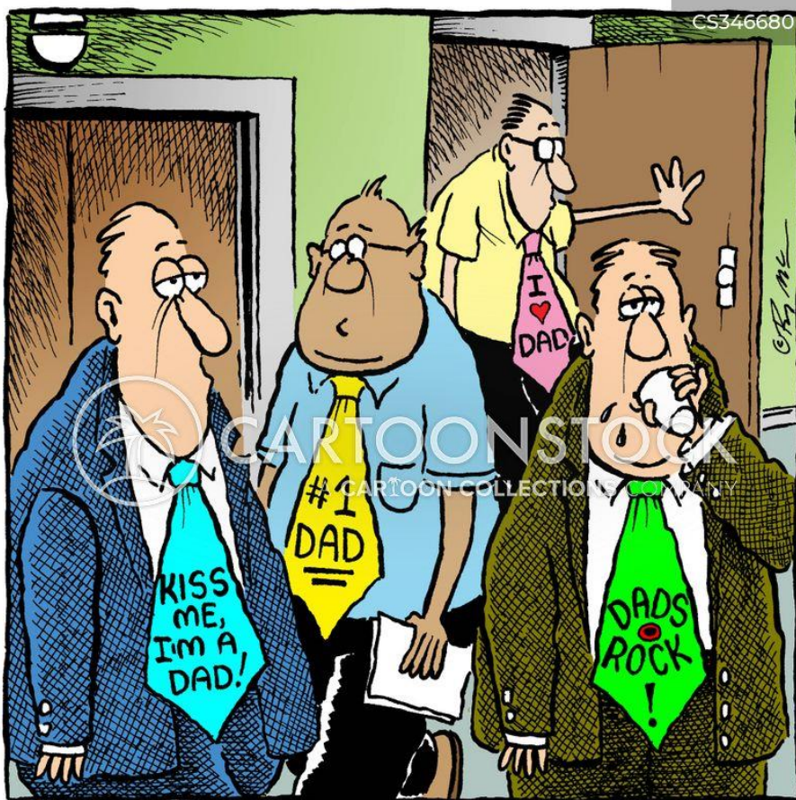
The day after Father's Day.

IF THERE WAS A PILL TO CURE PROCRASTINATION, I WOULD PROBABLY TAKE IT TOMORROW.