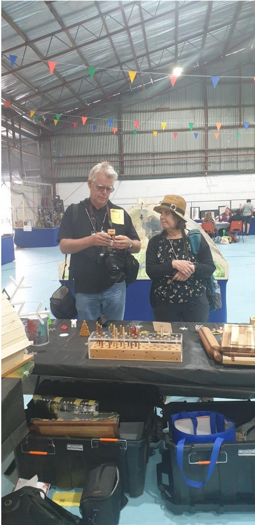
Visitors from the Apple Isle!