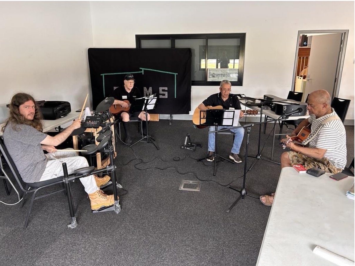
Musos at it again!