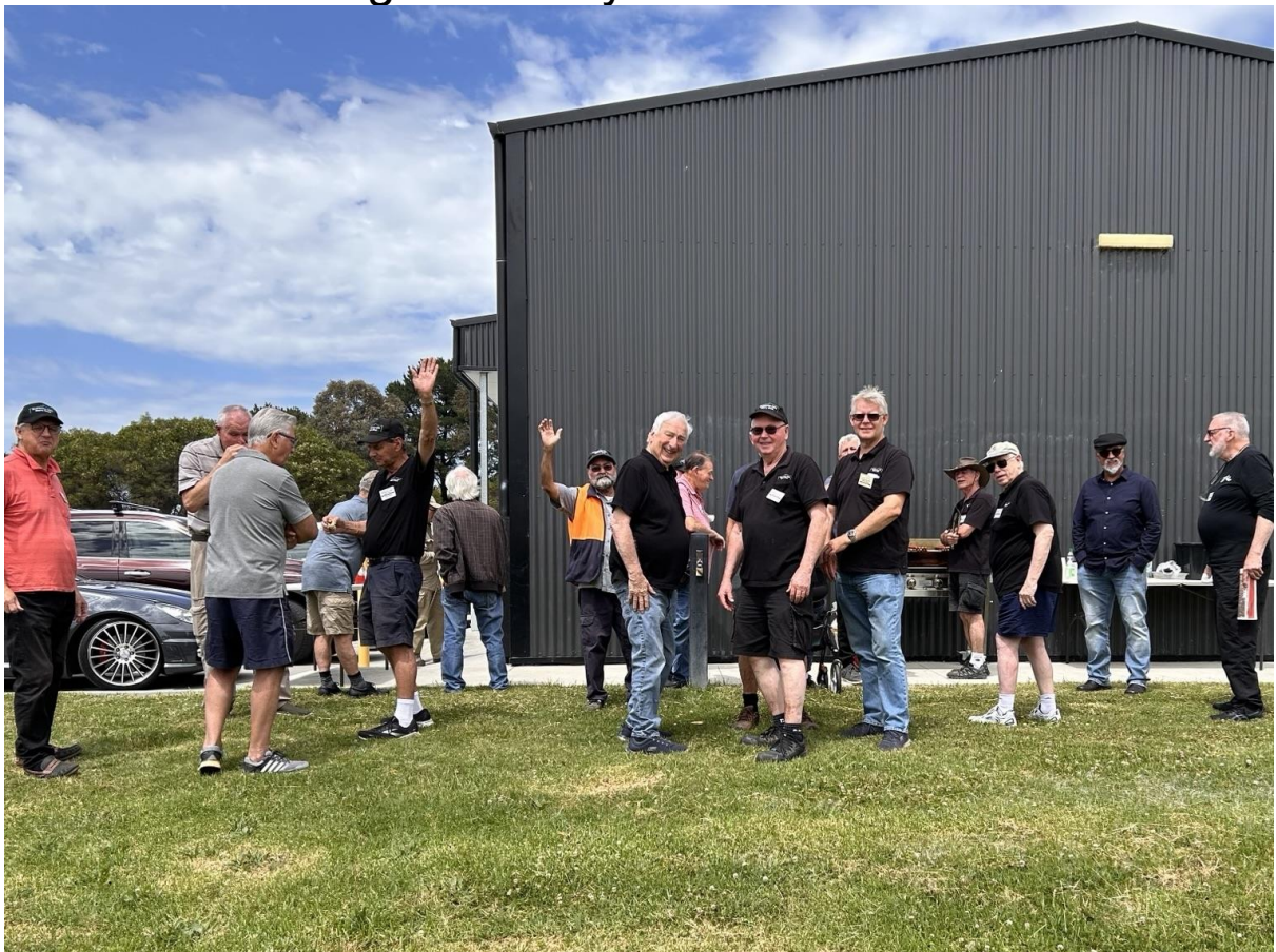
A gathering of "Shedders"