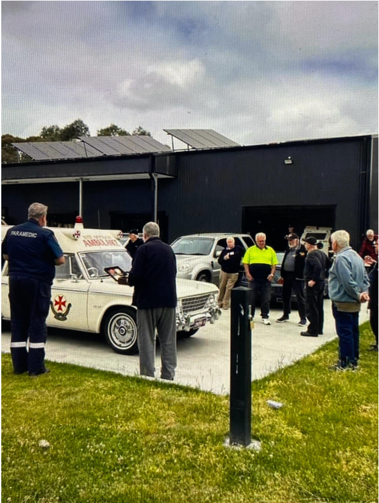
Shedders doing what the shed is there for!