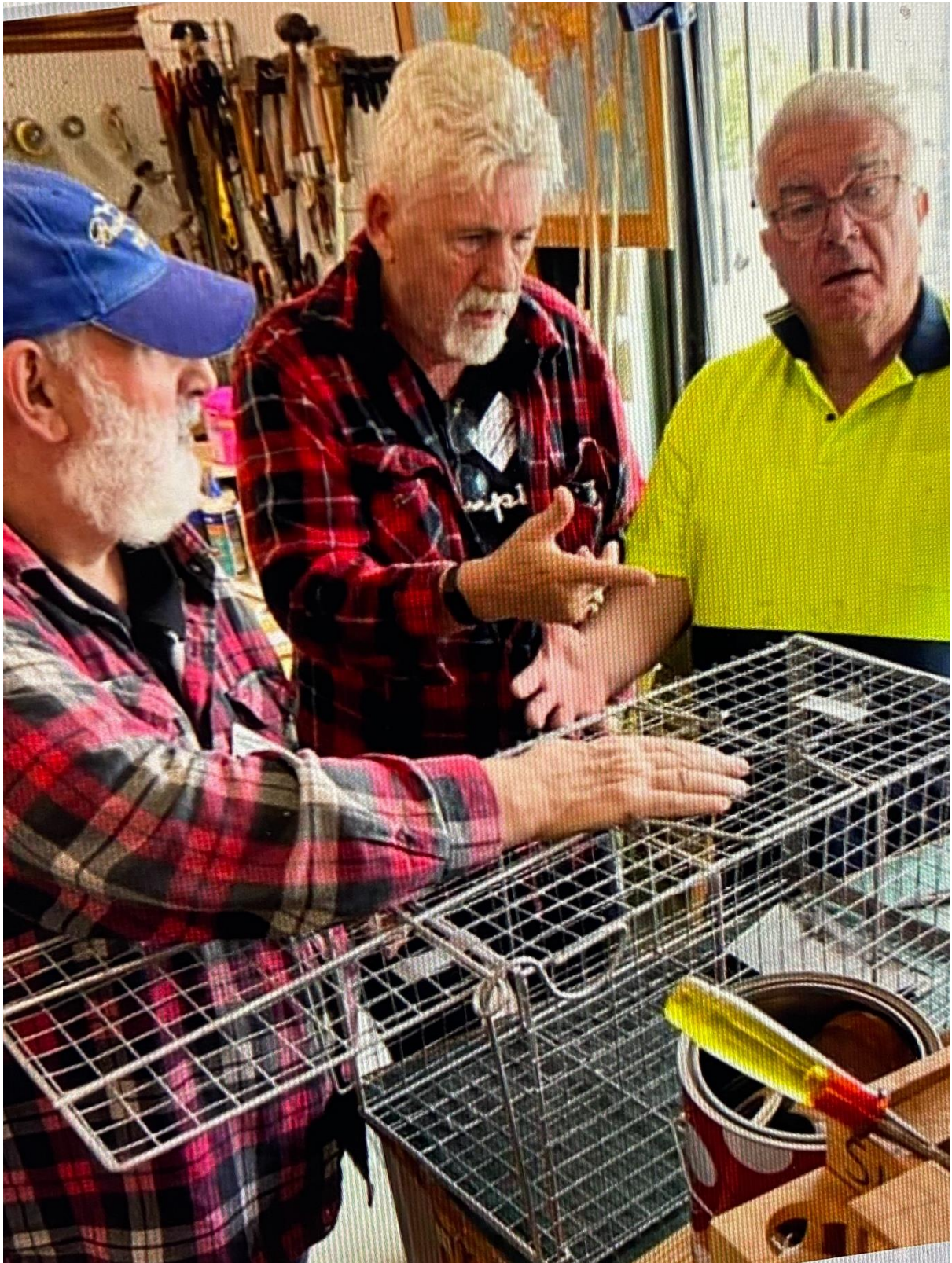
Maestros being “cagey”