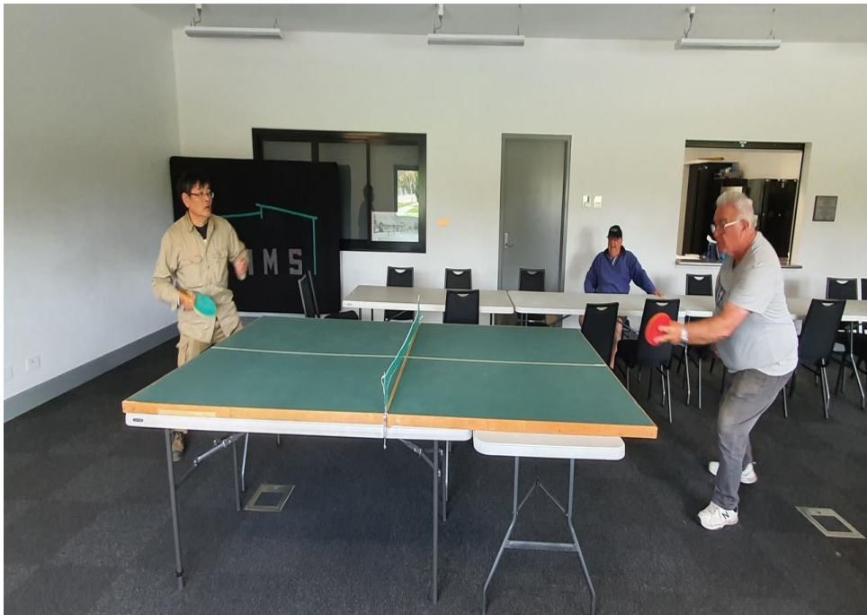
They're at it again!