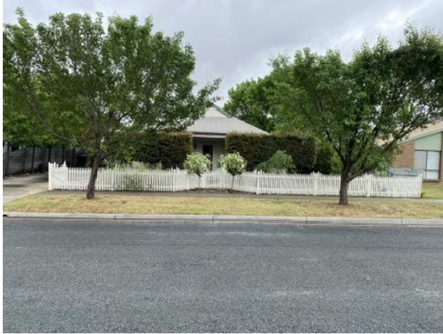
Our beautiful abode in Moama.