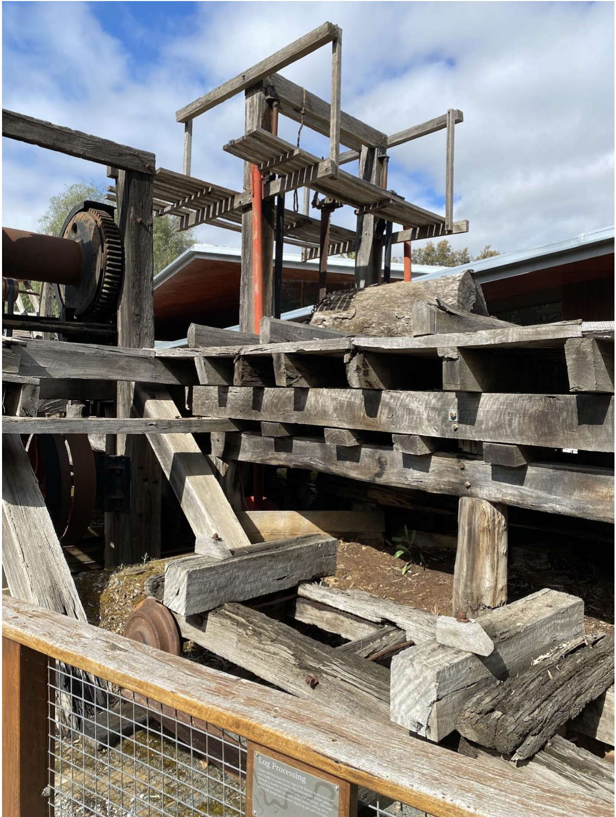
Great big pulleys and gear cogs, OHMS nightmare!