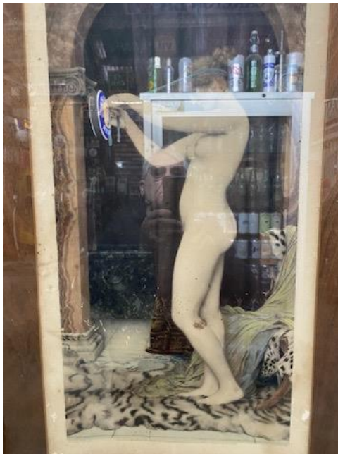
Almost a rude picture!

Stay tuned for the gripping back roads to Kilmore tale. Coming to your Bulletin in no uncertain terms.