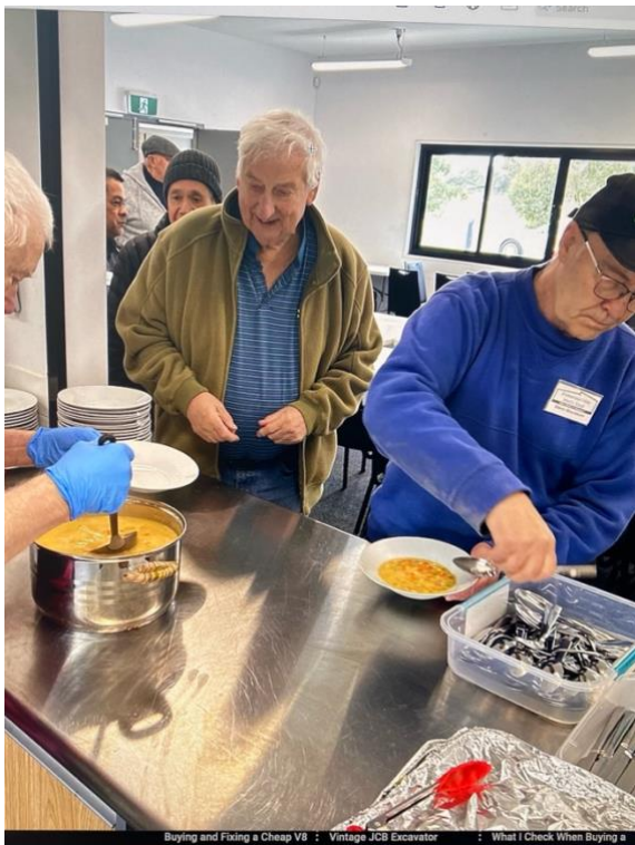
Buying and Fixing a Cheap V8 : Vintage JCB Excavator : What I Check When Buying a