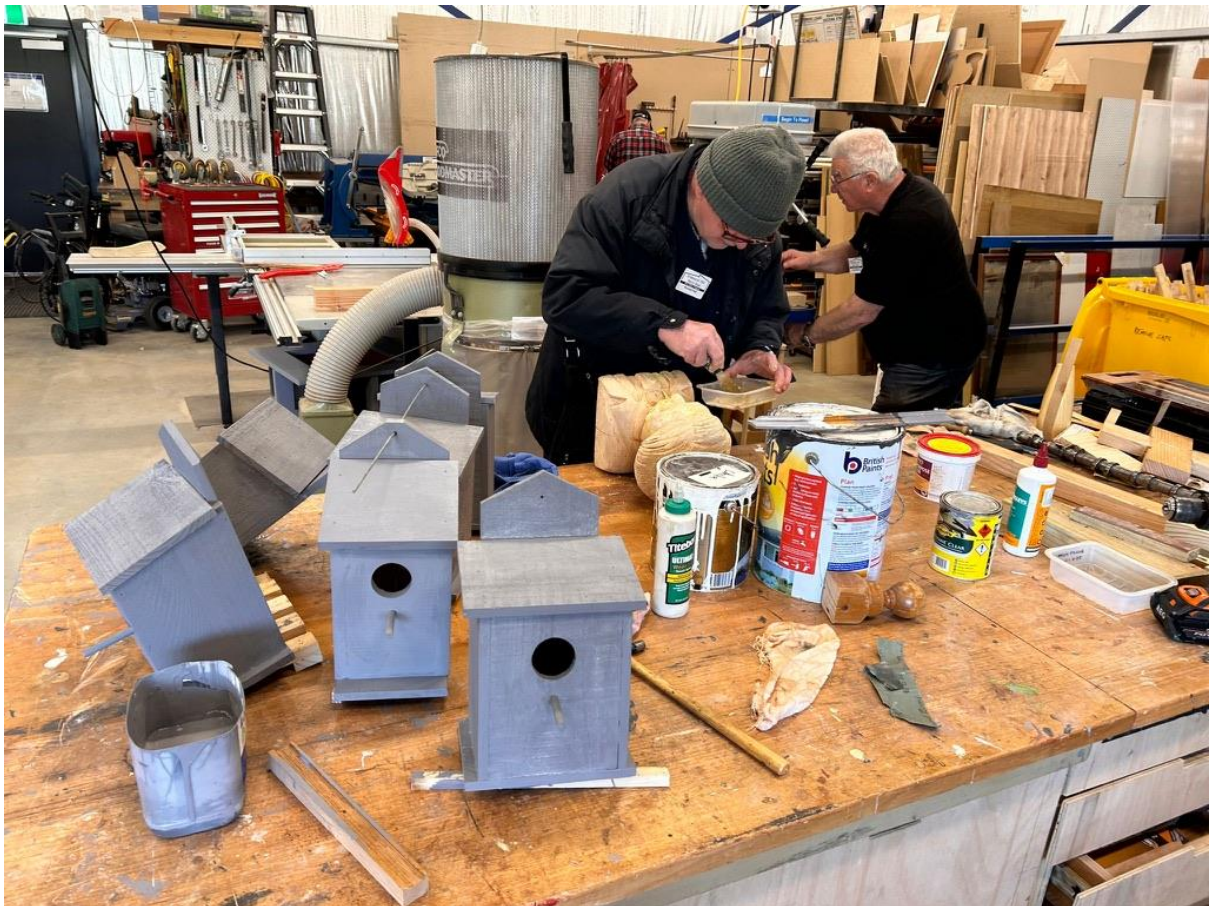
Free accommodation for the homeless.