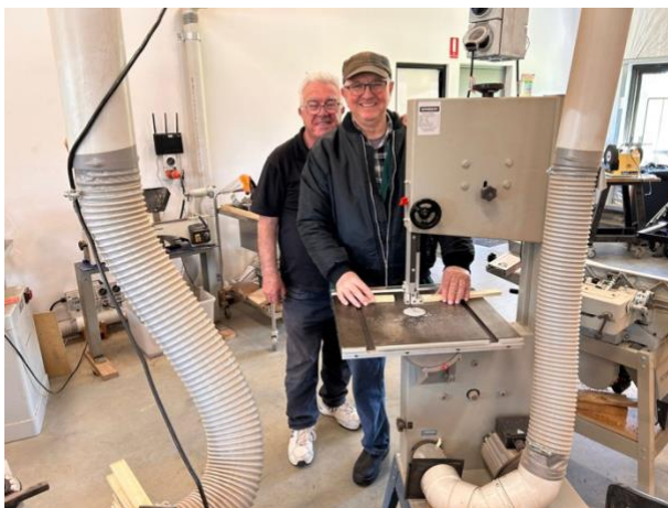
New members are coming out of the woodwork, much like termites.