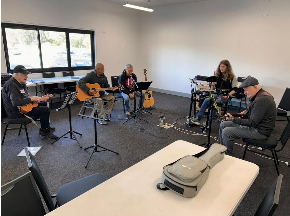
Our very own intrepid Music Group. Can you name the members?