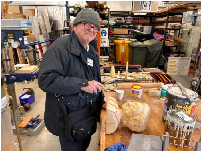
Heads I win!