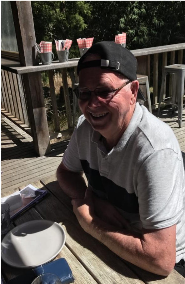
Rogues Gallery # 3.

Now here's a guy who gives Rogues a bad name! Just a nice bloke who does heaps around the Shed.