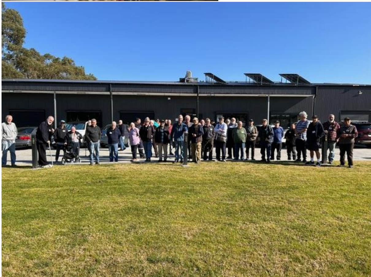
The members practising an emergency evacuation.