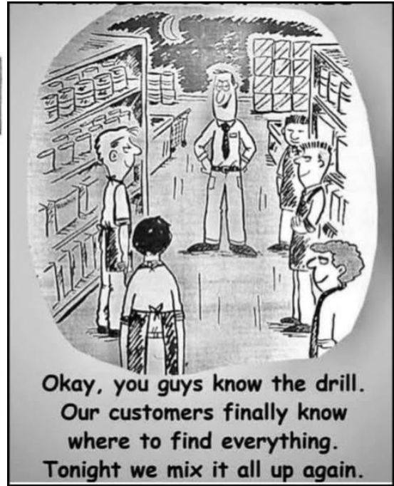
Okay, you guys know the drill. Our customers finally know where to find everything. Tonight we mix it all up again.