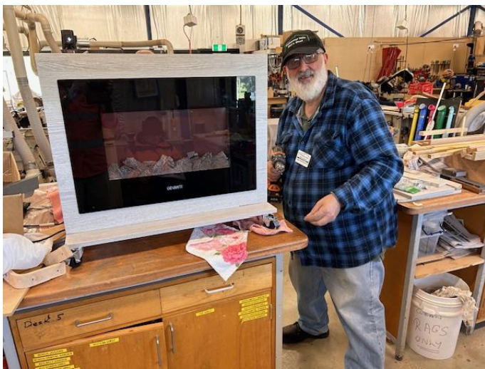
Will it keep you warm?