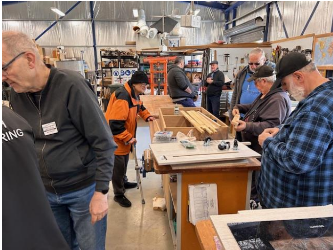
Heads down Arse up!