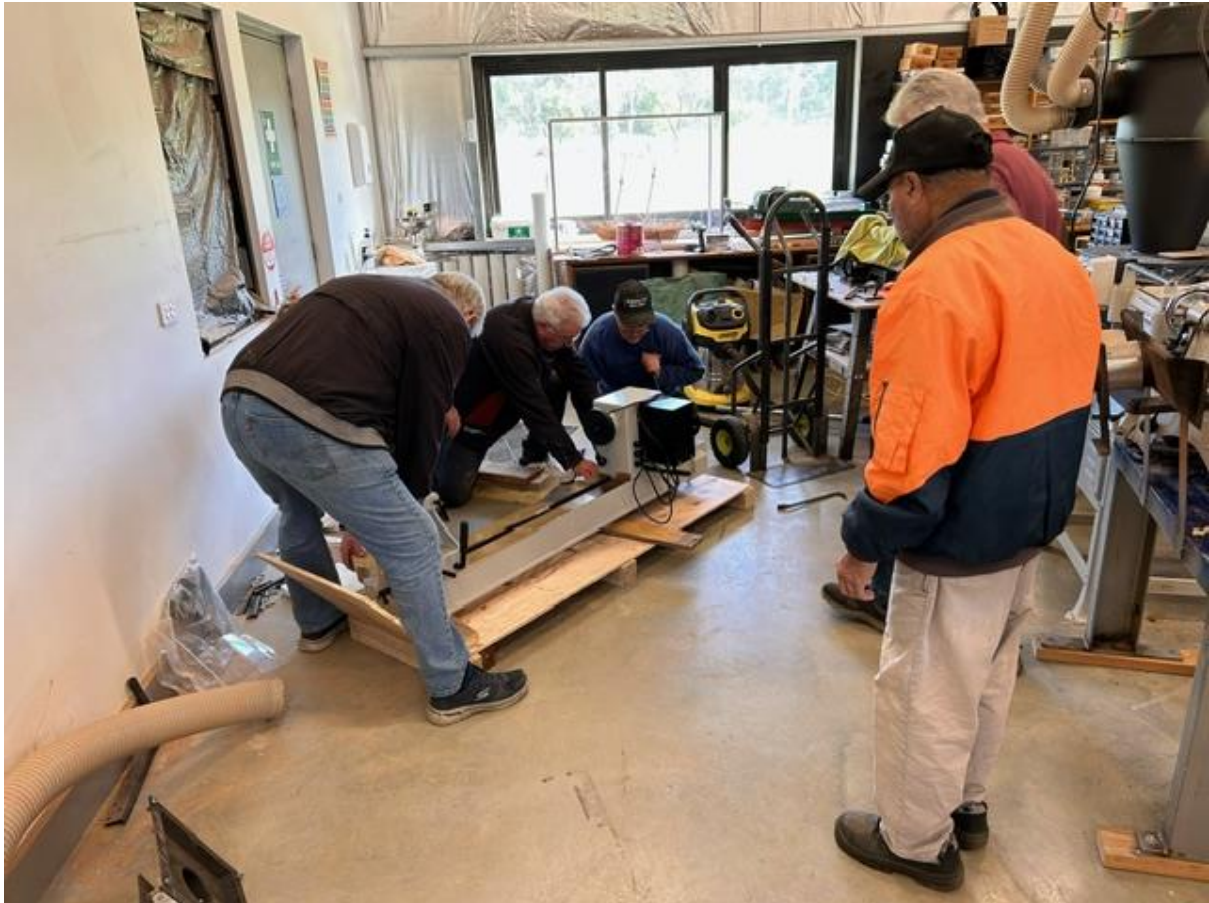
More members getting involved and no “Plumbers Cracks”