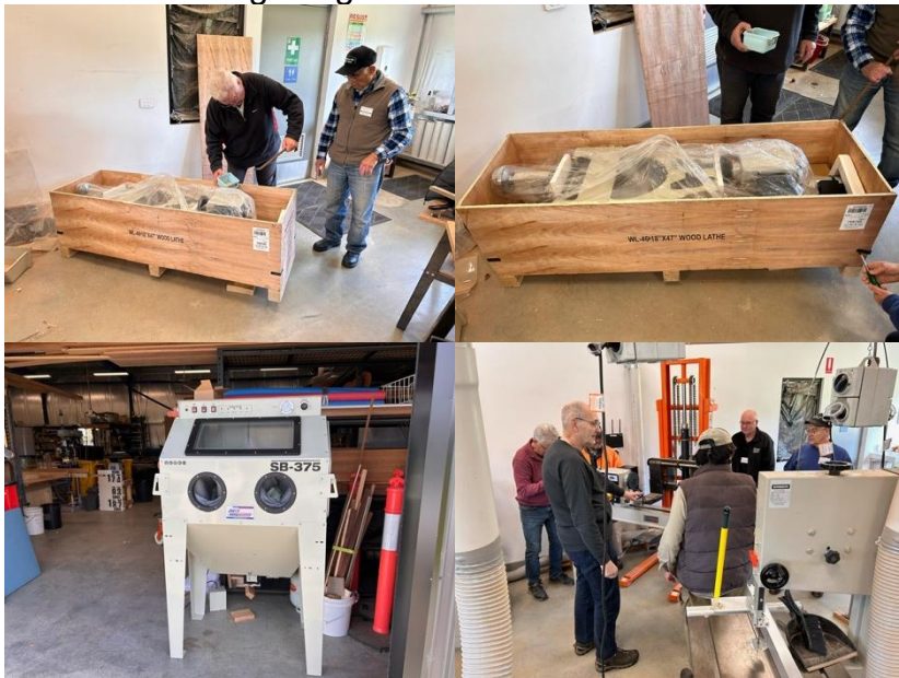
Wait till the others get a whiff.

Remember if you make a mess clean it up!