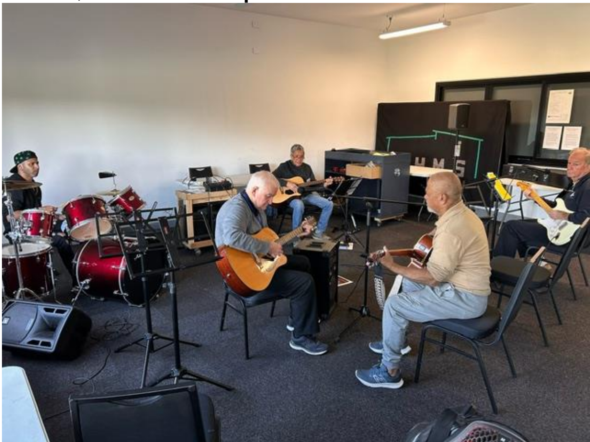
The Musos in full flight.

If you make a mess anywhere in the shed, Clean it Up!