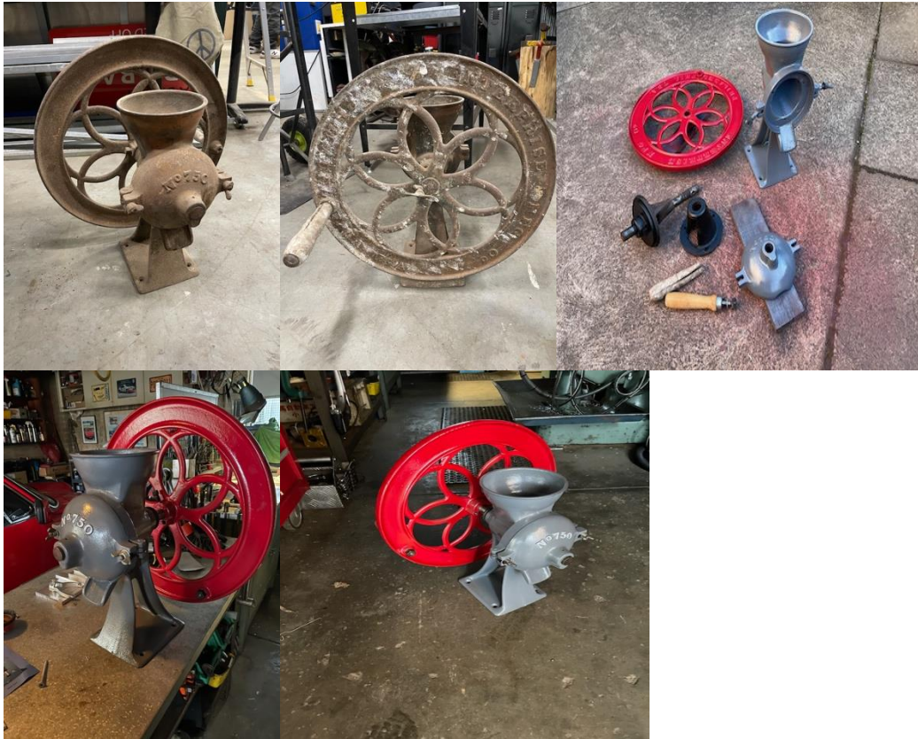
The various stages of renovating the Corn Grinder by Rommie Alday for Myuna Farm