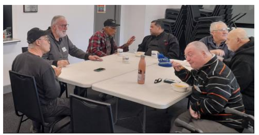
Waiting for lunch