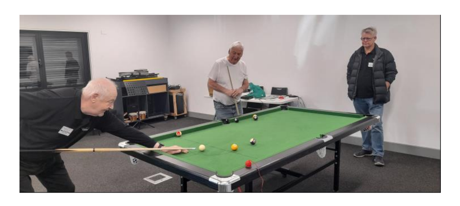
Sharpening up on lost skills.

The Naughty Boys are organising a Pool comp. starting this coming Thursday.