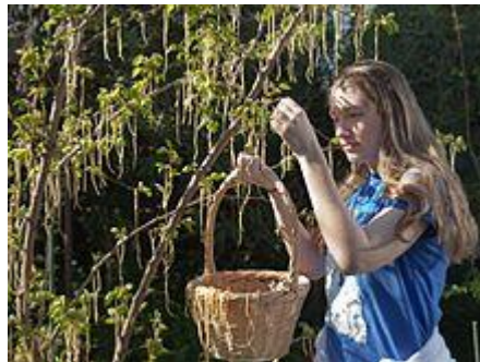
Harvesting Spaghetti from the Spaghetti Tree.