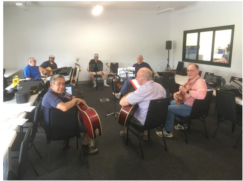
The always popular music group will perform at our official opening on 1<sup>st</sup> March