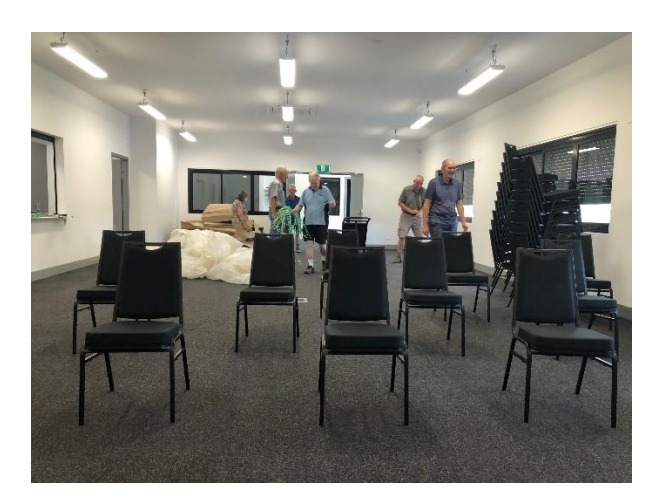
Before our first meeting.