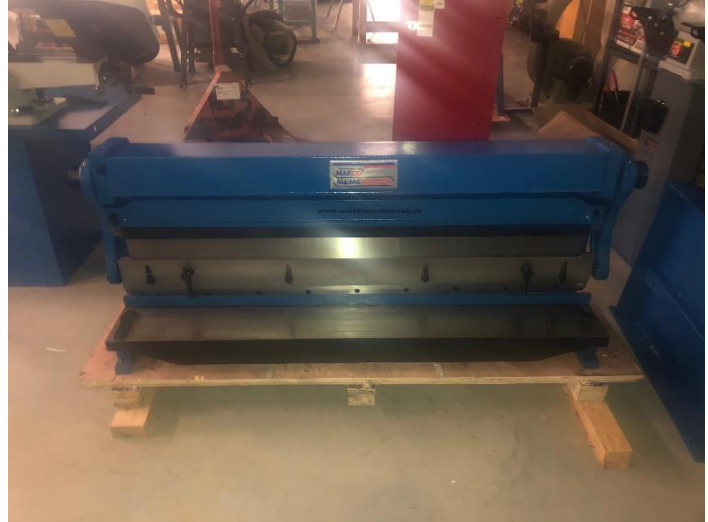
Metal guillotine and bender