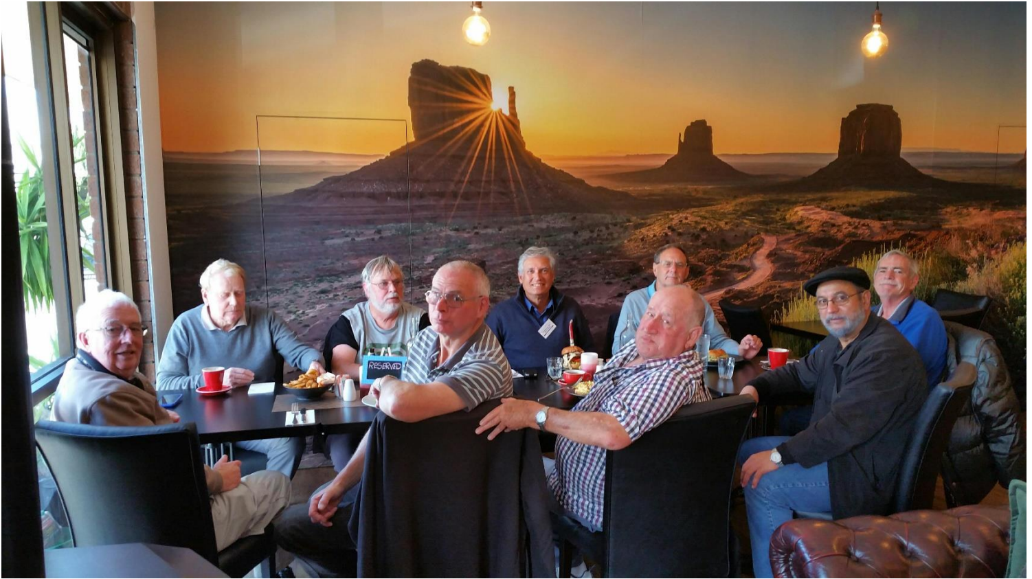
At the Maton Guitar Factory.