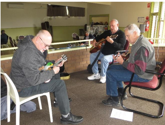
The musos had another session.

A lot of members contributed to this ongoing project and we all have our homework.