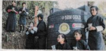
Sky Hydrant-filtered water at a school in Bhutan.

The hydrant requires no electricity or chem-