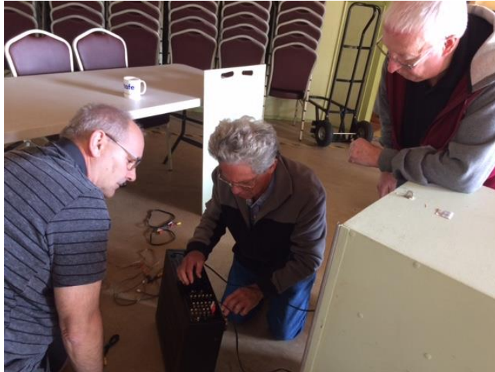
Above - Fitting the sound system