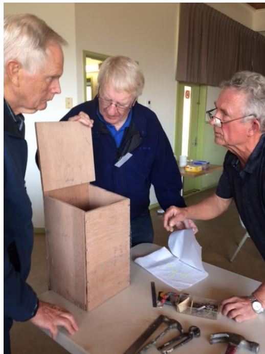
Below - building a slider box